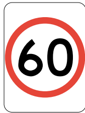
Speed-limit sign (Standard sign)