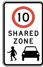
Shared zone sign