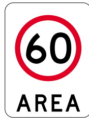
Area speed-limit sign