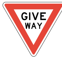
Give way sign

Note 2 For this rule, give way means the driver must slow down and, if necessary, stop to avoid a collision — see the definition in the dictionary.